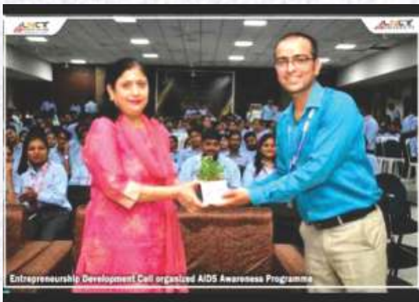
AIDS Awareness Programme for UG Students