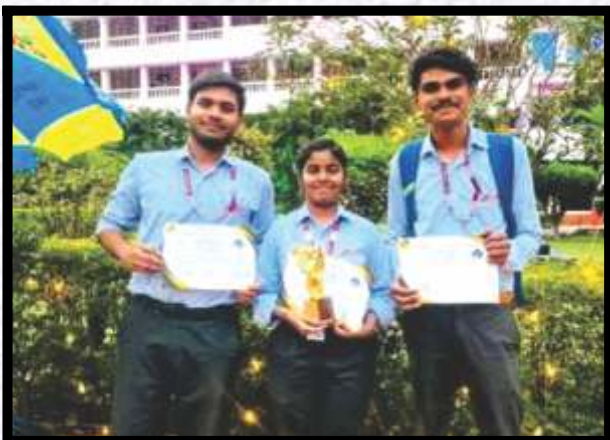
Winners of N.R.I quiz competition