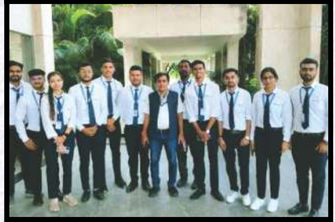
Participants of VIDYARTHI VIGYAN MANTHAN NATIONAL CAMP 23-24