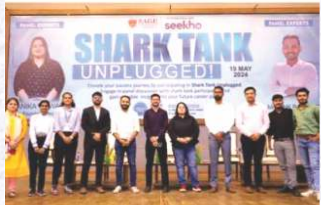
Winners of Business Idea Competition 'SHARK TANK' Sage University