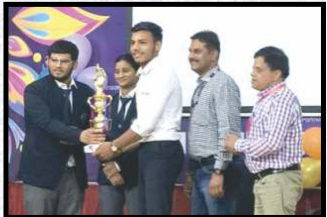
Winner of Engineering Olympics from MBA 1st year